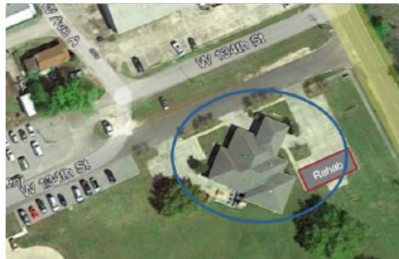
Chronic Dialysis Clinic